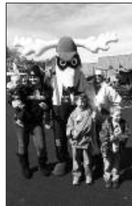
Elroy the Elk enjoyed his time at the Annual Chili Cook-off.

Free to all veterans. $6.00 to all guests. Please sign up in the Antler Lounge by Nov. 8